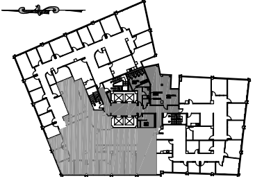
KEY PLAN NO SCALE