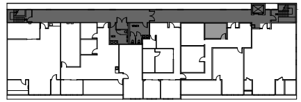
KEY PLAN NOT TO SCALE