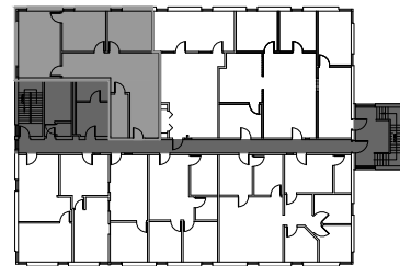
KEY PLAN NOT TO SCALE