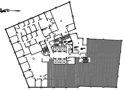
KEY PLAN NO SCALE