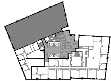
KEY PLAN NOT TO SCALE