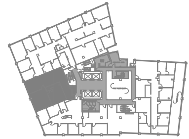
KEY PLAN NOT TO SCALE