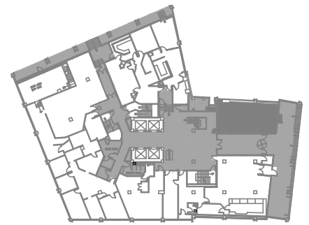
KEY PLAN NOT TO SCALE