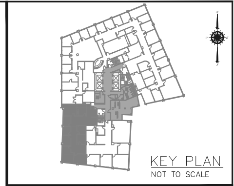
KEY PLAN NOT TO SCALE